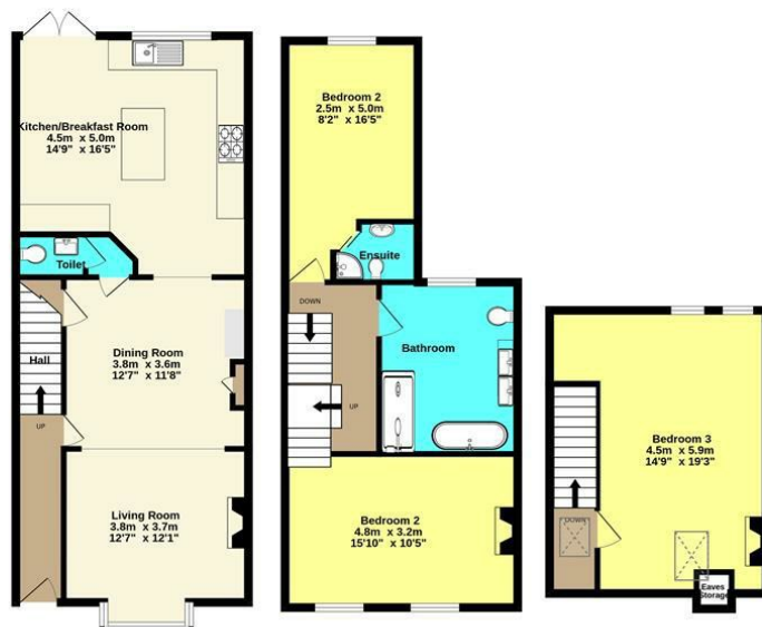
Ground Floor 57.8 sq.m. (623 sq.ft.) approx.